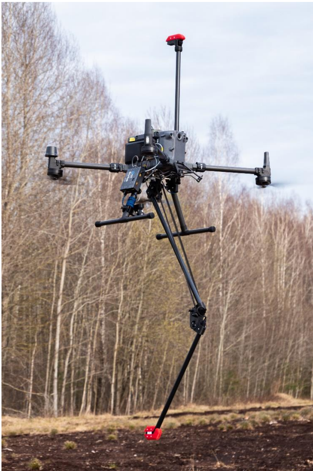
Image: MagNIMBUS in gradiometer configuration in flight

Ultra-sensitive airborne integrated magnetometer system powered by QuSpin QTFM Gen-2 atomic total-field magnetometer sensors